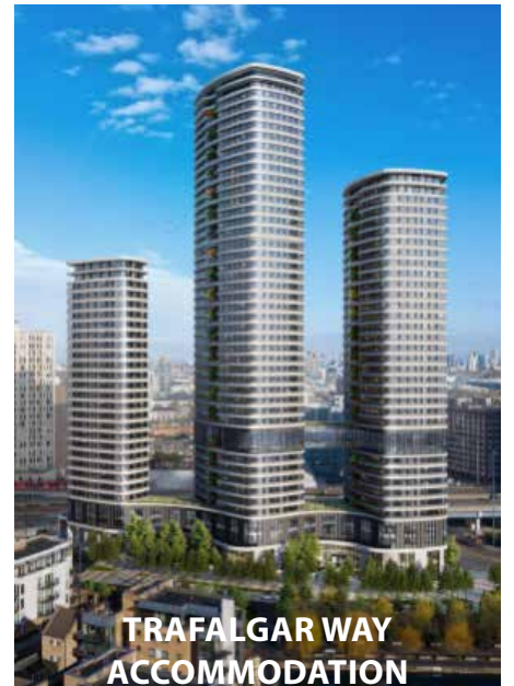
TRAFALGAR WAY ACCOMMODATION