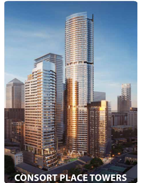
CONSORT PLACE TOWERS