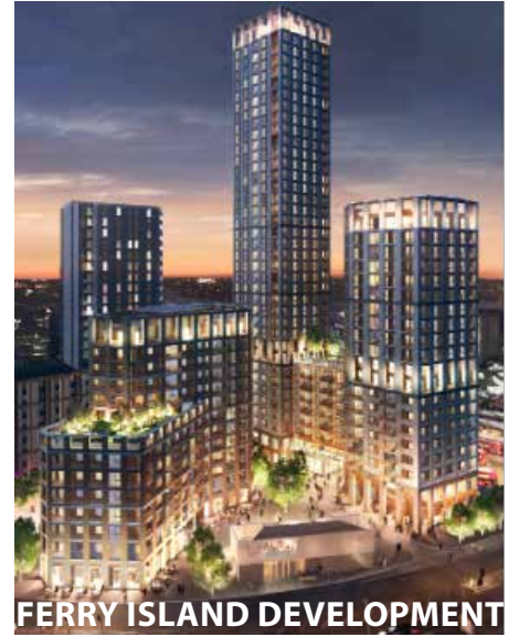
FERRY ISLAND DEVELOPMENT